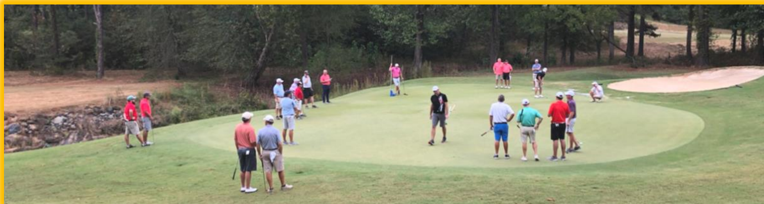
Shoot Out Hole #11