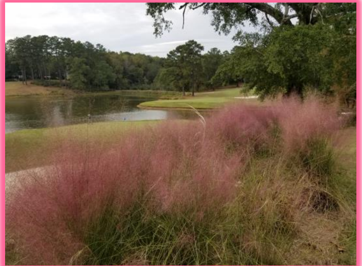
Beautiful Muhly Grass #12