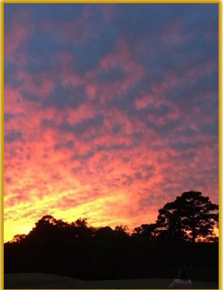
Sunset at the Brickyard

Please come out for fun, friendship and fellowship!