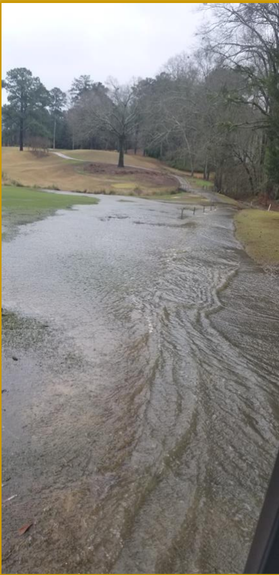
Rain Drenched Hole #7