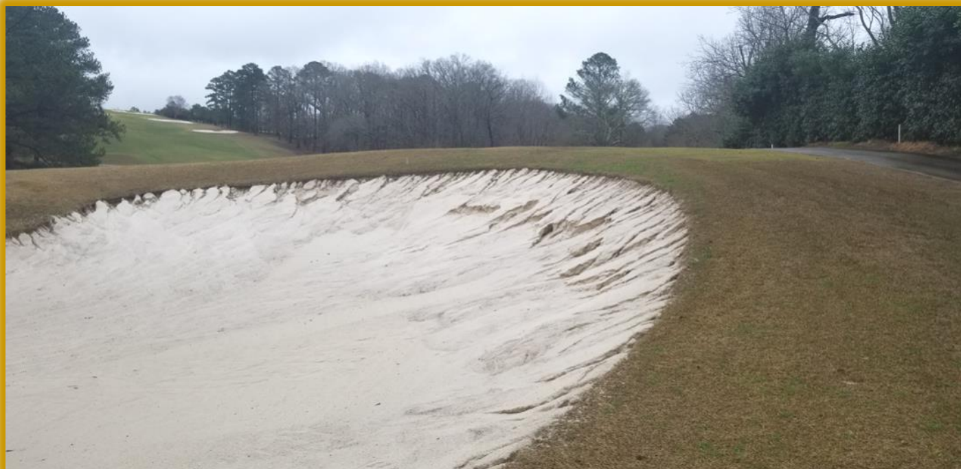
Rain Drenched Bunker on #8