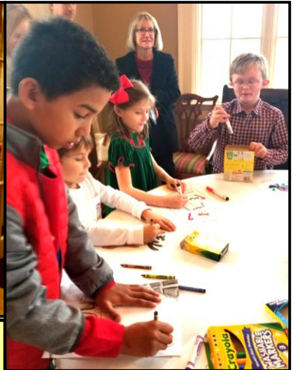
Children Arts & Crafts