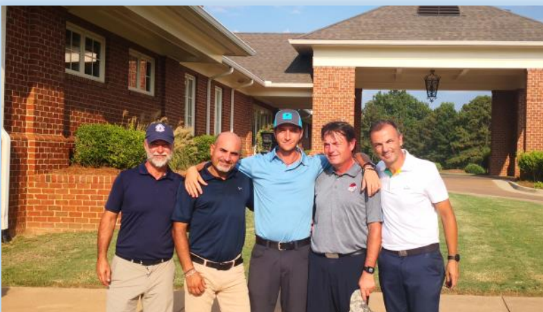
Guests Playing the Brickyard from Italy