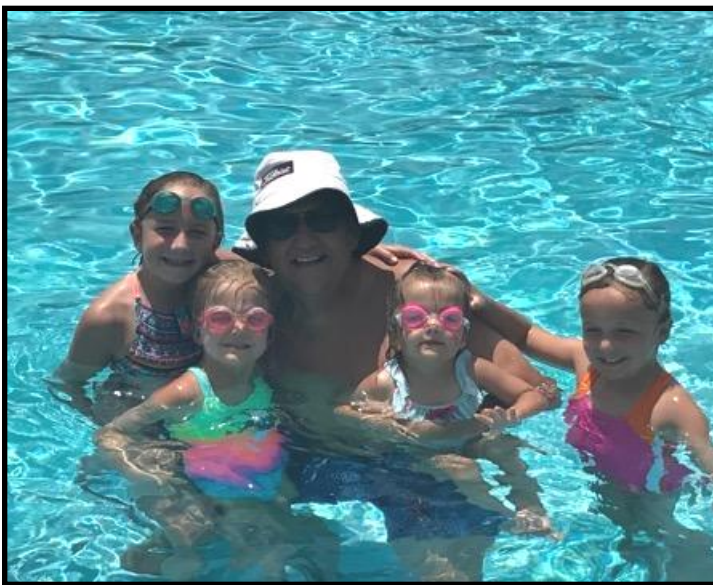
The Benson & Gurley Families