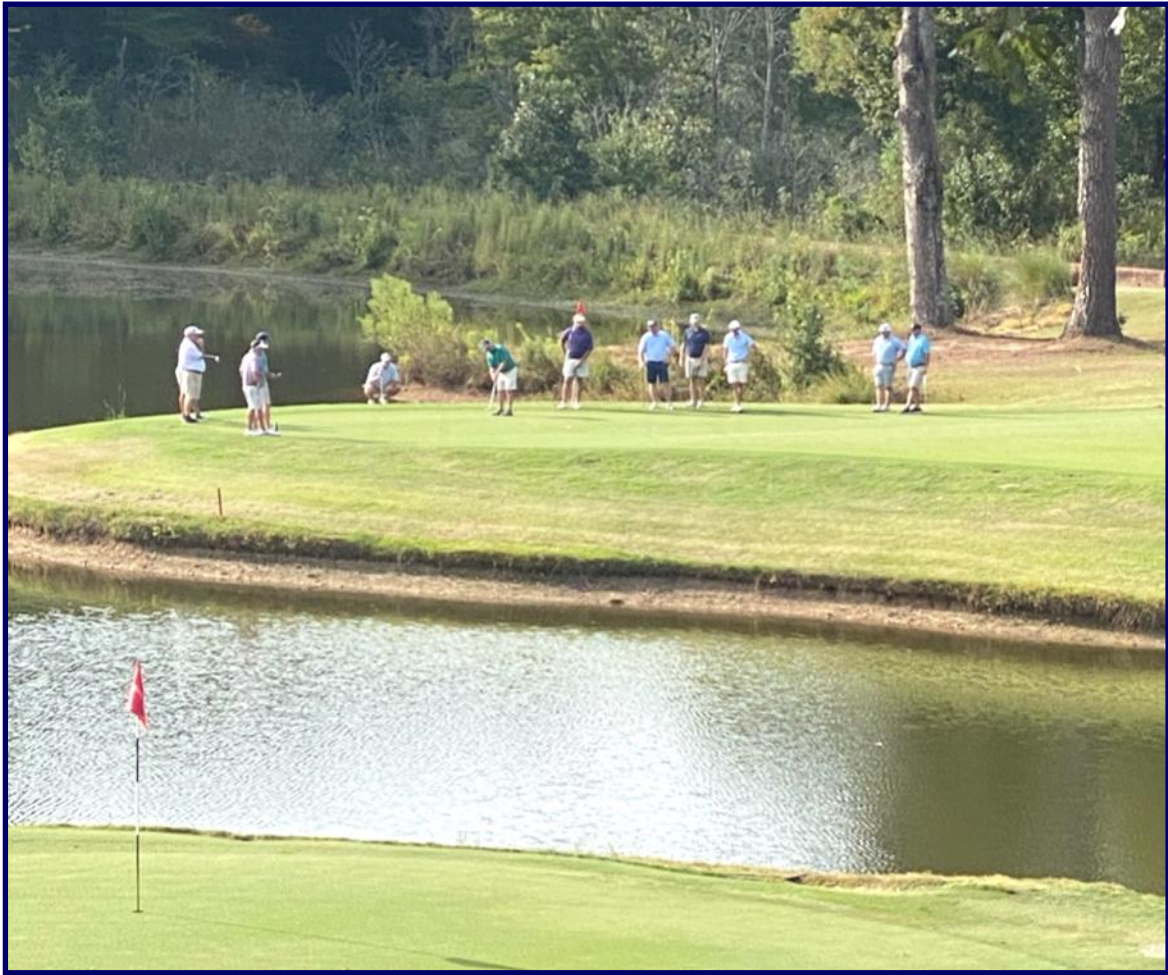
Fun at the Member Guest Par 3