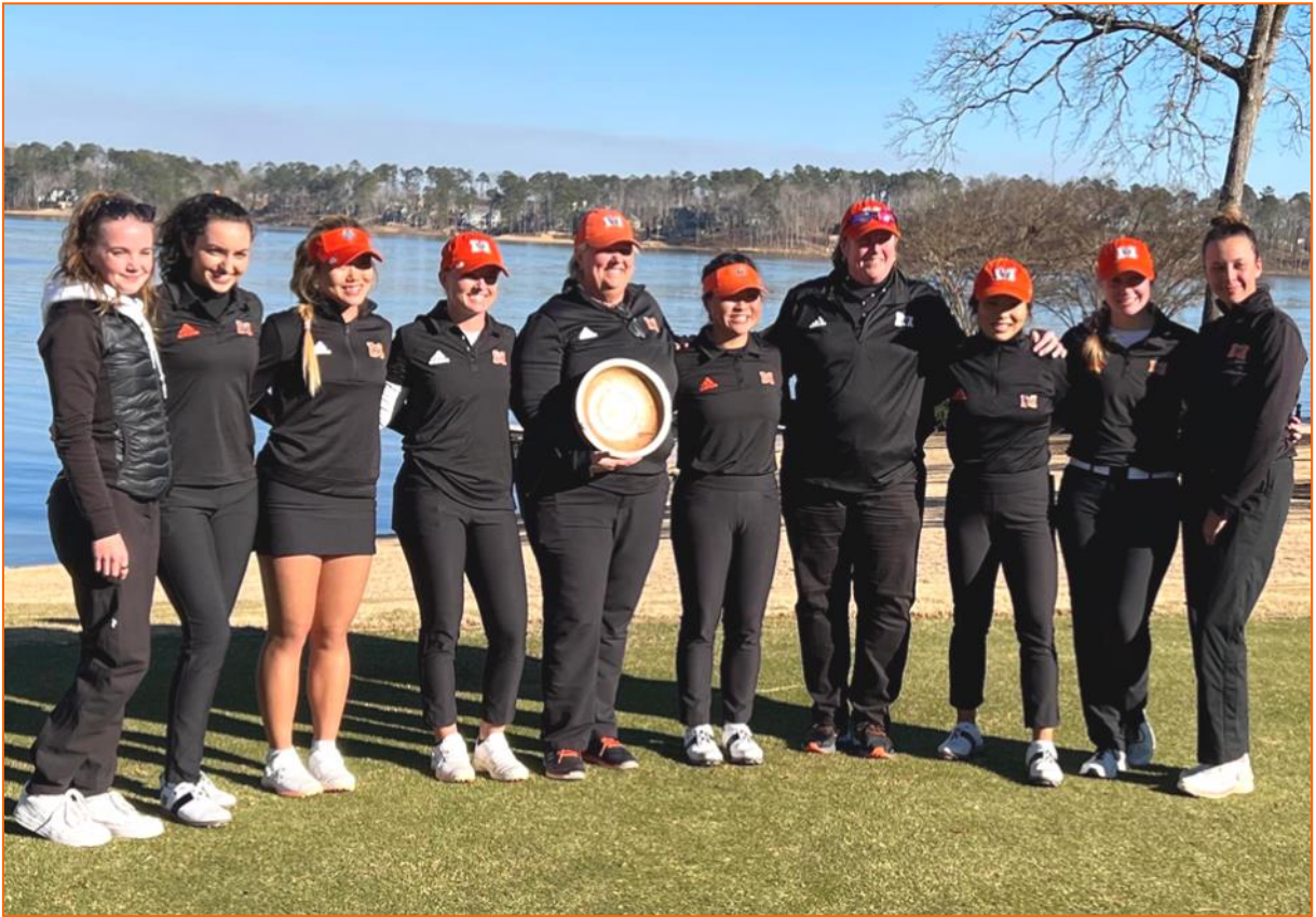
Mercer Women's Golf Team