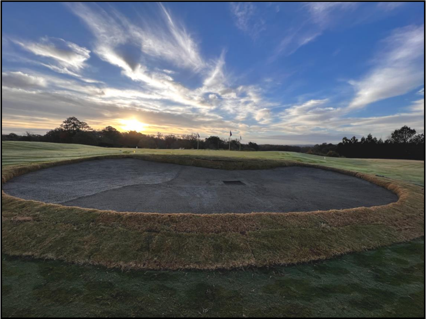
New Practice Bunker