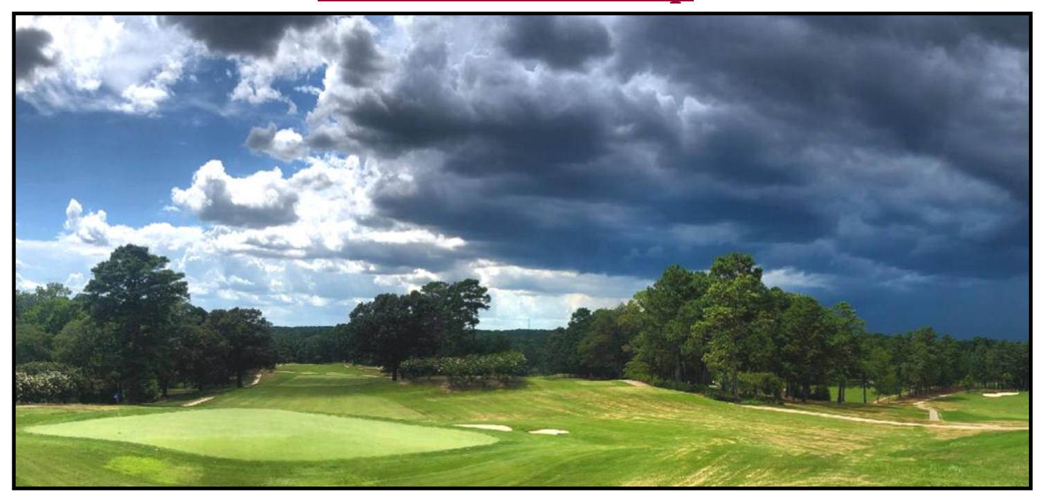
Saturday, July 25th. When the Pro Shop messages the golf cart that lightning is near, please return to the Clubhouse.