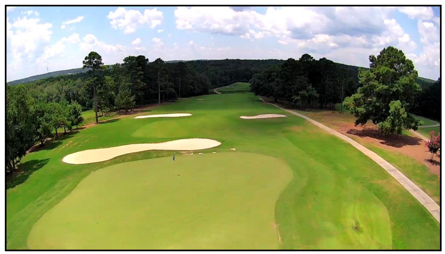
Drone Image of #9