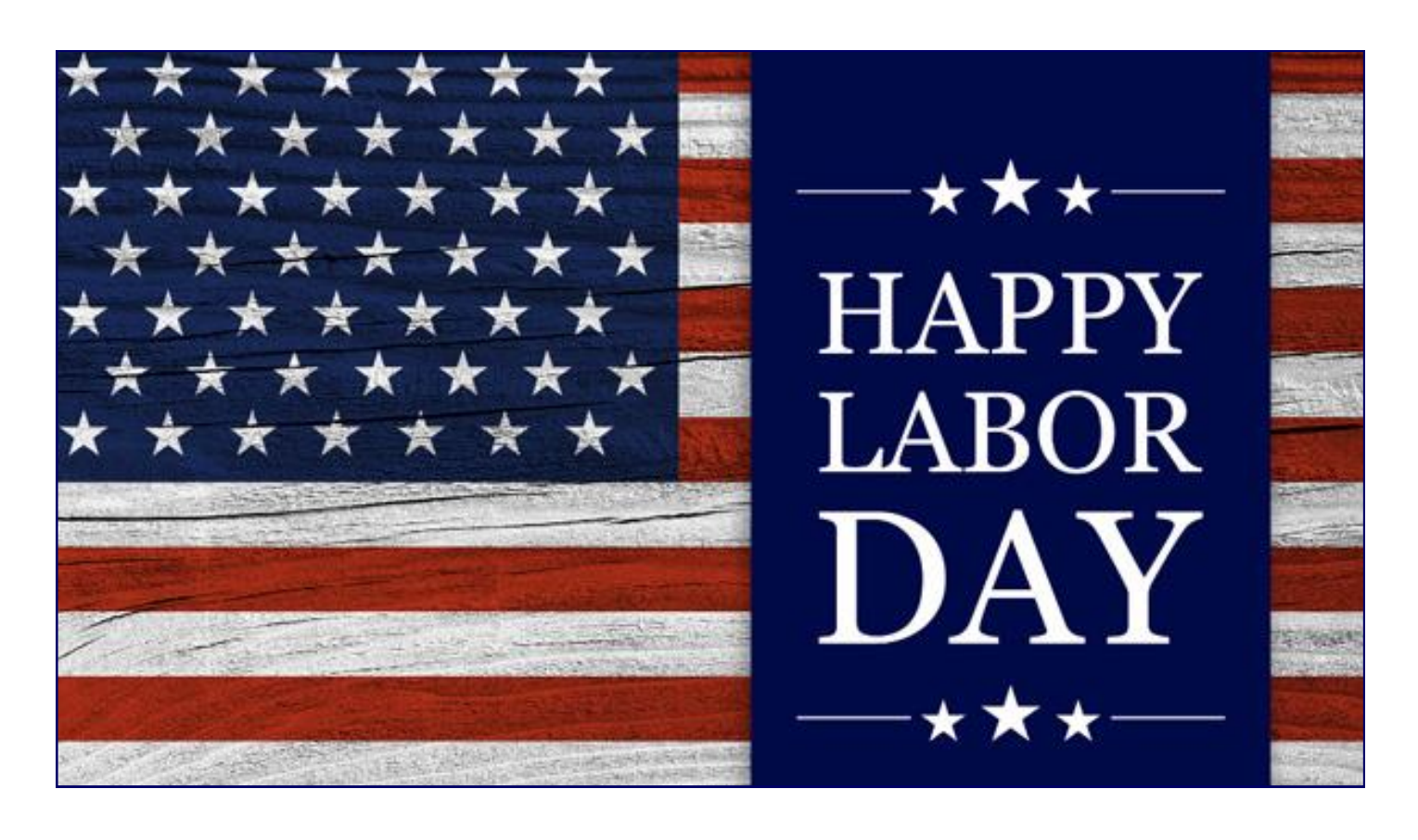
The Clubhouse, Pavilion, Practice Facilities, Golf Course, and Pool Are Open Monday, September 7, 2020