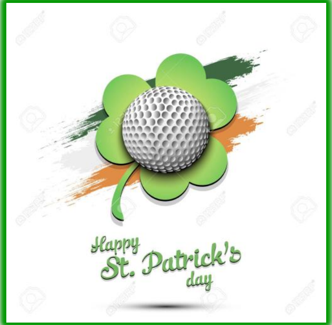
Class A Superintendent

Spring is in the air. With some of the warmer temperatures we've had, the grass will be greening up soon, azaleas blooming, and the trees with flowers like the Dogwoods will be sprouting flowers. I am ready for the winter to be over.