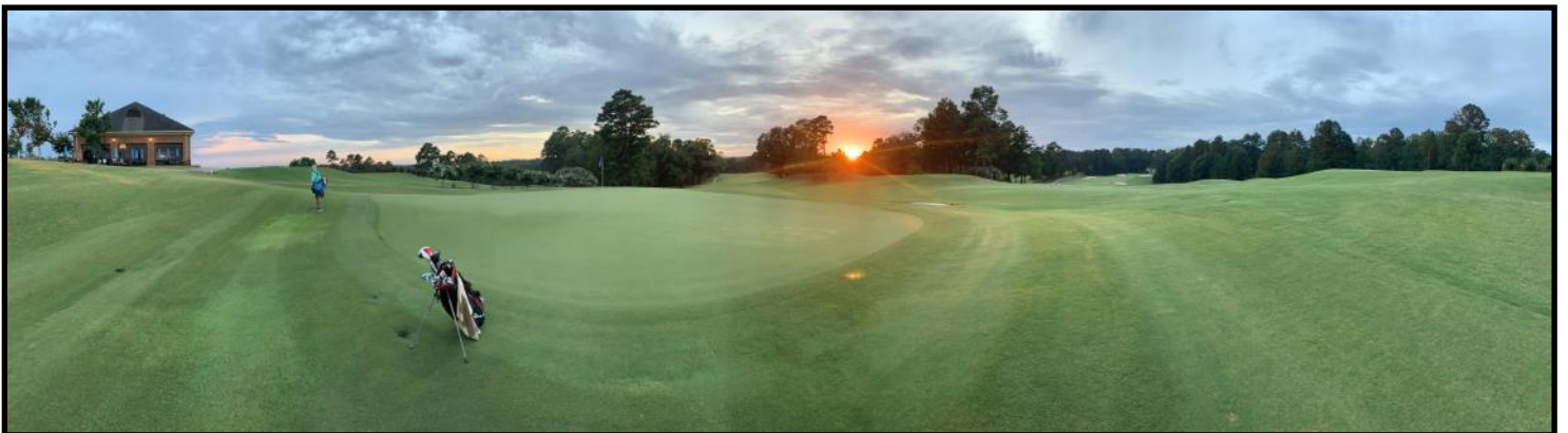
#18 at Sunset June 30,2020