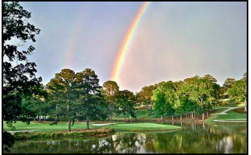
Beautiful Rainbow #6 & #12