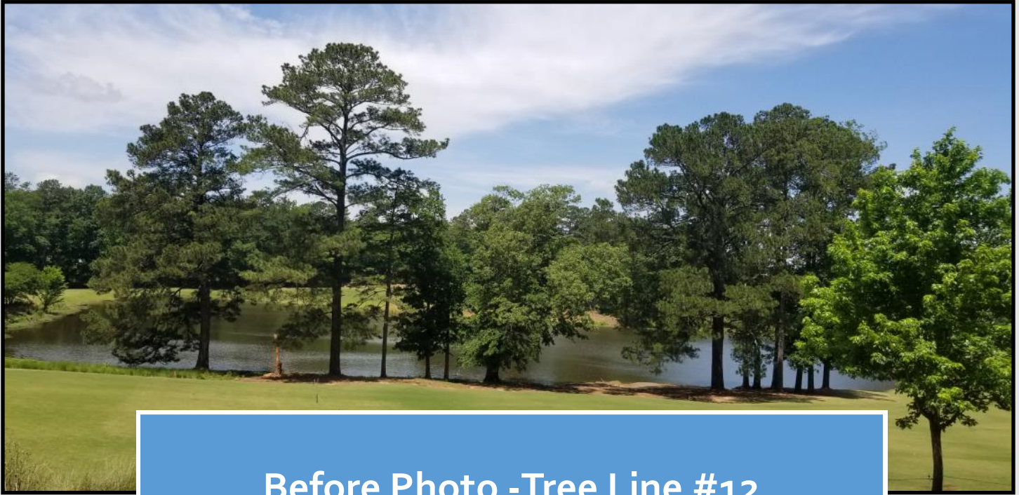
Before Photo -Tree Line #12

Tree Limbing & Pruning on the Golf Course Looks Awesome!!!